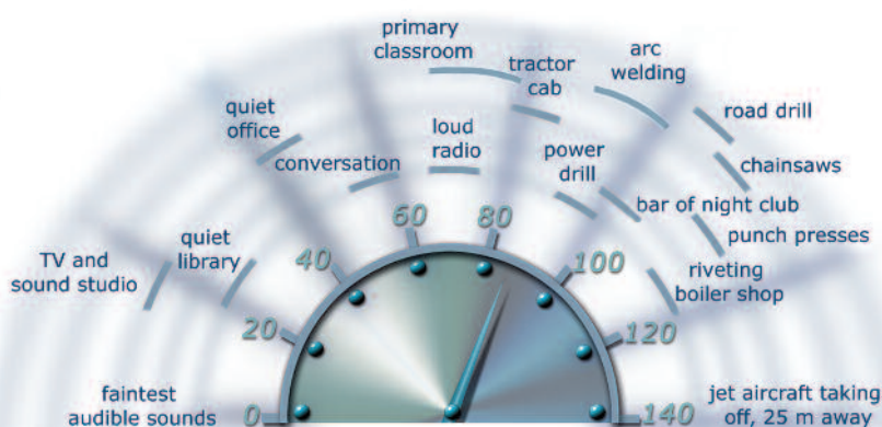
Figure 1 Examples of typical noise levels

Some examples of typical noise levels are shown in Figure 1. This shows that a quiet office may range from 40-50 dB, while a road drill can produce 100-110 dB.